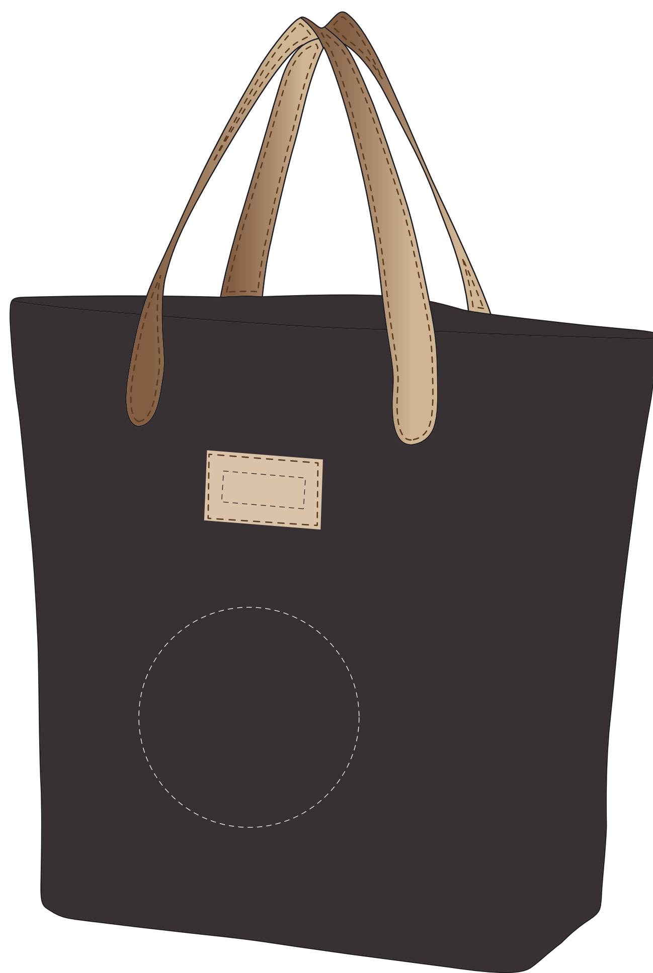
COMPOSITE NOT ACTUAL SIZE

Dashed Line For Imprint Area Only. Will Not Print.