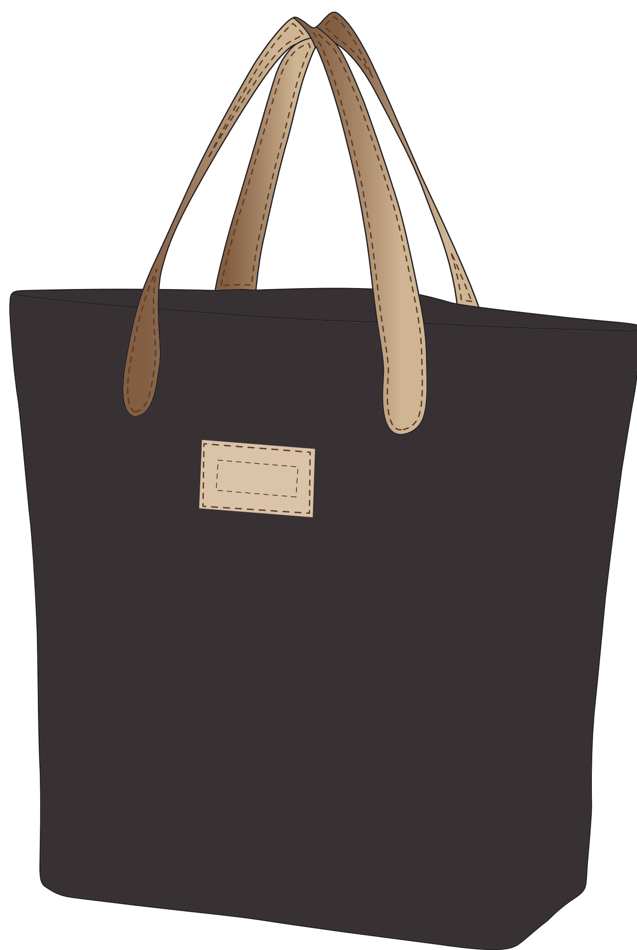
COMPOSITE NOT ACTUAL SIZE

Dashed Line For Imprint Area Only. Will Not Print.