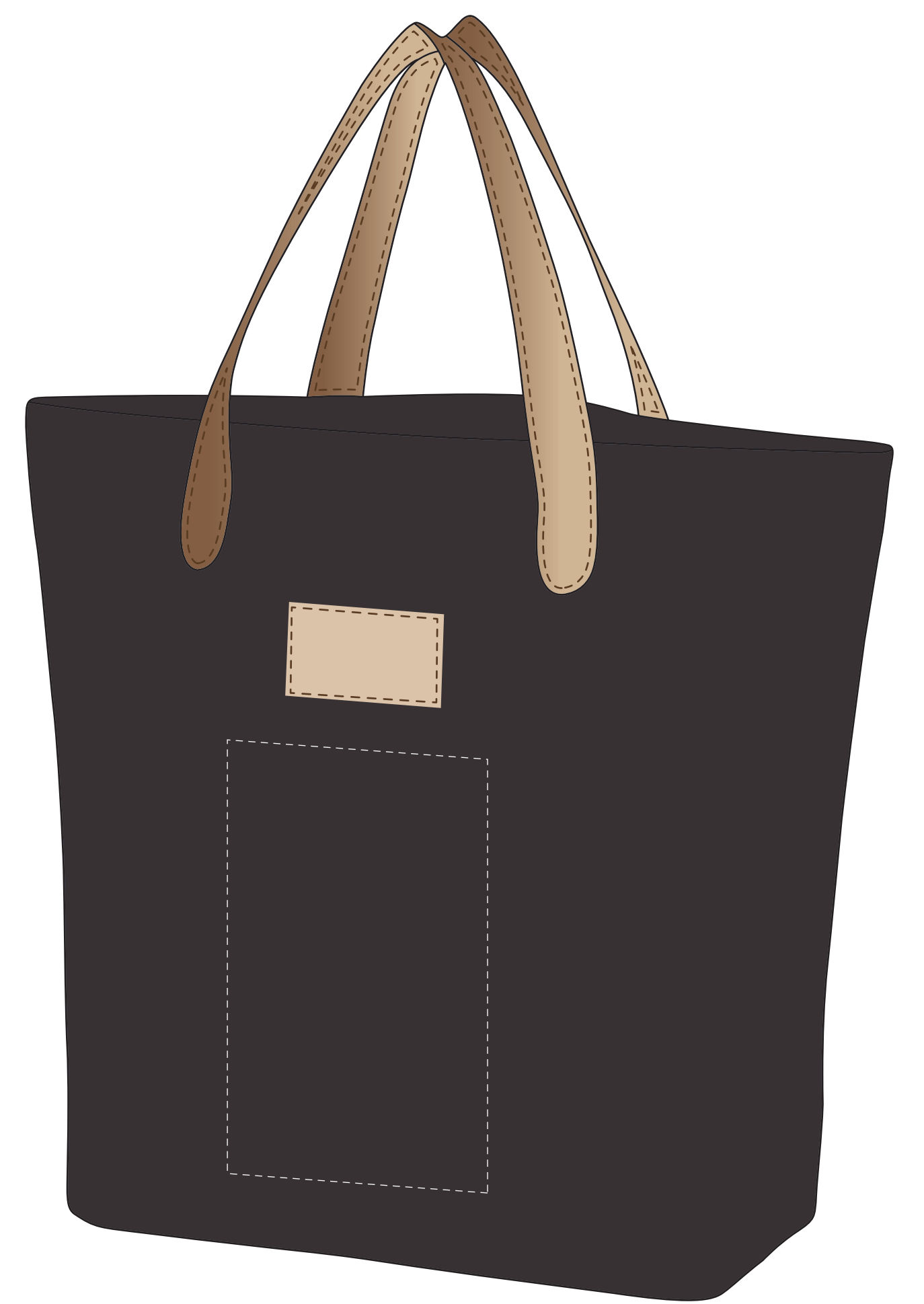
COMPOSITE NOT ACTUAL SIZE

Dashed Line For Imprint Area Only. Will Not Print.